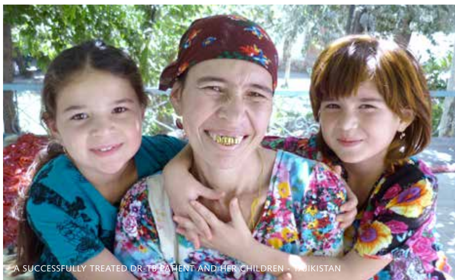
A SUCCESSFULLY TREATED DR-TB PATIENT AND HER CHILDREN - TAJIKISTAN

Between 2011 and 2014 a number of important policy documents and guidelines for TB control in Kazakhstan, Kyrgyzstan, Tajikistan and Uzbekistan were developed with KNCV's assistance under the TB CARE I project ( www.tbcare1.org ).