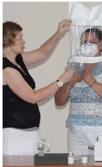
IC TRAINING/FIT TESTING IN KYRGYZSTAN

KNCV contributes to the development of human resources of the national TB programs through trainings and workshops that are essential for improving quality of TB care. The introduction of new tools and approaches is always accompanied by a training component. Their implementation includes practical training for relevant specialists of NTPs. KNCV's approach in building HR capacity is based on the cascade method. We usually train the national team of trainers, who later conduct trainings countrywide.