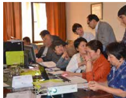
NATIONAL WORKSHOP ON DEVELOPMENT OF PMDT PLAN IN UZBEKISTAN