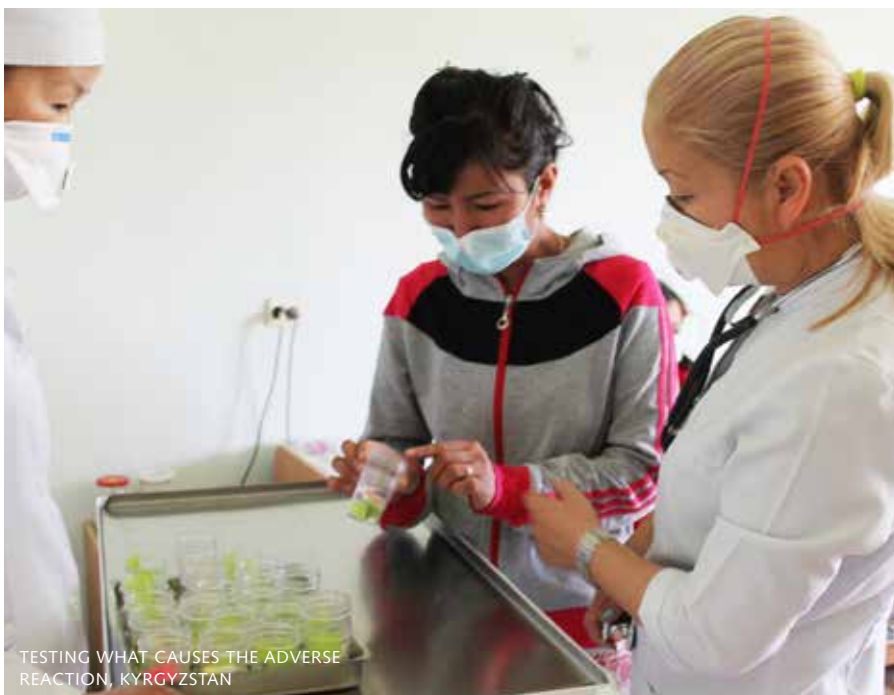
TESTING WHAT CAUSES THE ADVERSE REACTION, KYRGYZSTAN