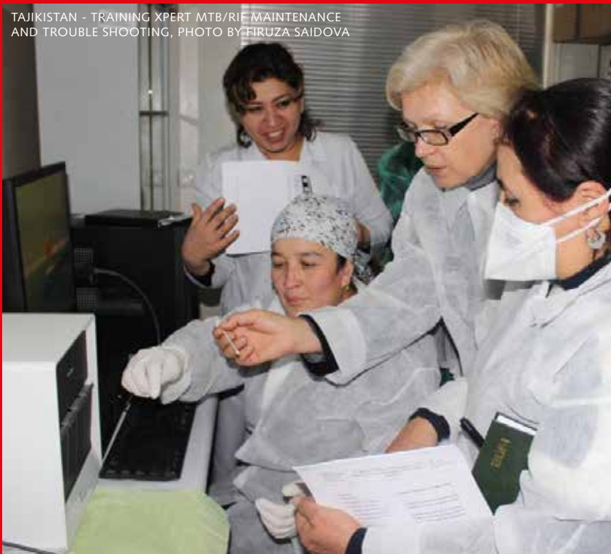
TAJIKISTAN - TRAINING XPERT MTB/RIF MAINTENANCE AND TROUBLE SHOOTING

This includes the development of national Xpert MTB/RIF implementation plans, clinical protocols and diagnostic algorithms, procurement and maintenance plans, monitoring and evaluation systems (in Kazakhstan, Tajikistan, Uzbekistan, Kyrgyzstan); the development of sample transportation instructions in Tajikistan; and piloting the model of effective use of Xpert MTB/RIF in four regions of Kazakhstan and in five regions of Tajikistan. As a result of the implementation of Xpert MTB/RIF, MDR-TB detection has increased significantly in Tajikistan, the time for diagnosis of MDR-TB was reduced, and the time to start treatment with second line drugs was cut back from 76 days to 8.5 days (in Kazakhstan and Tajikistan).