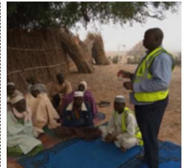
Volunteers accessing Nomadic Communities and settlements