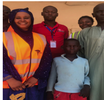
JHF a female Volunteer posing with a cured DR-TB child with his father

Community leaders, both male and female, were engaged as TB advocates. A cadre of volunteers, both male and female, were recruited and many were provided with motorcycles to reach rural areas for screening and to transport sputum specimens to TB laboratories. All activities in all three states were subsequently carried forward with funding from the Global Fund (via the NTLP) with matched funding from TB REACH as well as USAID with funding limited to Taraba state.